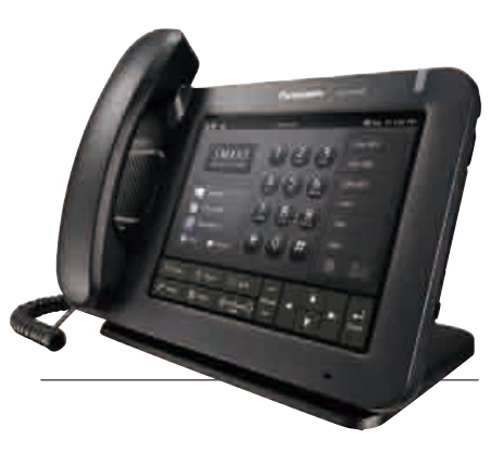
The KX-UT Series are smart terminals, having unique features with specific applications in mind.